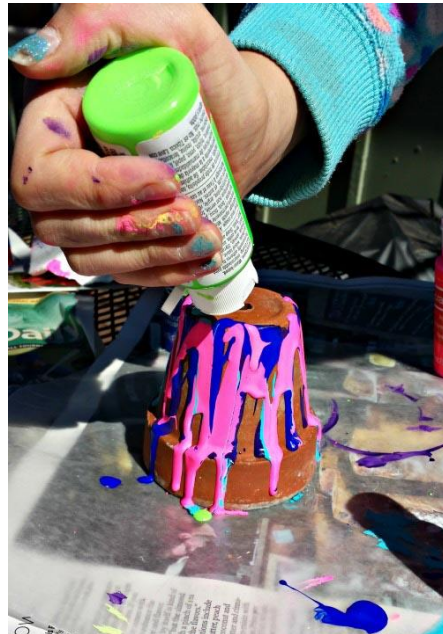
Easy Pot Painting - Process Art for Kids

You can use an older terra cotta pot for this project -- just be sure it has a rough feel to it (chalky on the outside) and not a smooth coating or your paint will just slide off).