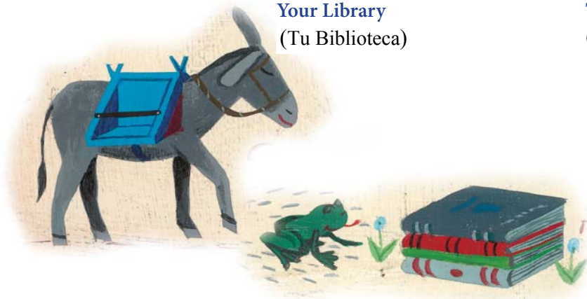
The Biblioburro (El Biblioburro)